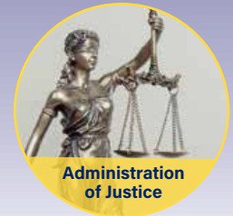
Administration of Justice