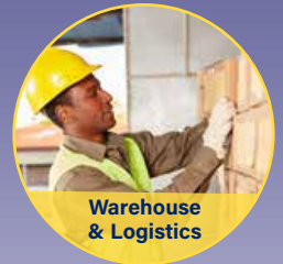
Warehouse & Logistics