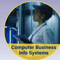
Computer Business Info Systems