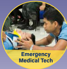
Emergency Medical Tech