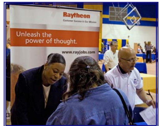
Representatives from Raytheon discuss career options with prospective employees at the annual Job and Career Fair March 28 at BCC's James Park Gym.