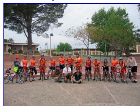
Ride for World Health medical students, repair/medical team specialist pose in the quad at Barstow Community College April 5 prior to their next stop in Kelso where they will camp out.

Monies raised during the Ride for World Health 2007 event will support G.H.A.P. (Global Health Access Program), a Los Angeles-based organization that primarily focuses on providing services to ethnic