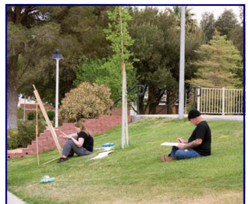
Students sit near the S building with their blank canvas in preparation for the student art show to be held on May 3.