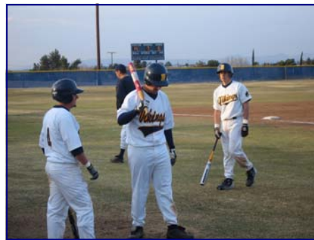
BCC Vikings baseball team members during a game against Taft College.