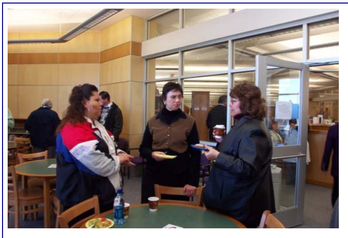
A nine-member team of college administrators, faculty and staff visits the college the week of March 20-24 to assess BCC effectiveness.

In addition to the recommendations, the team identified three commendations to include the following: