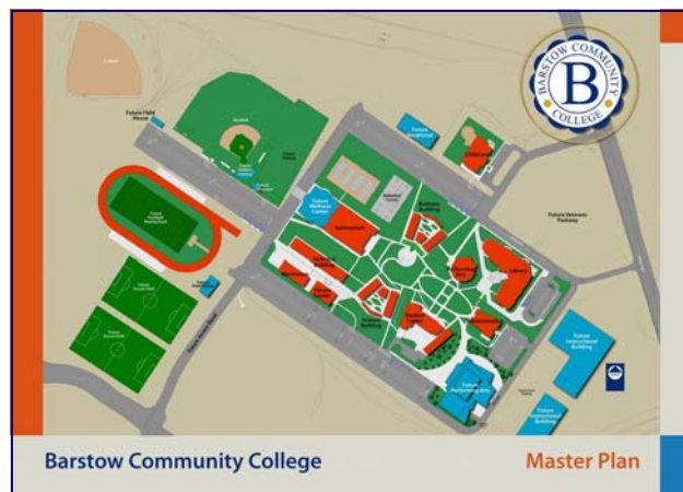
A birds eye view of the planned campus improvements at Barstow Community College. Red buildings are slated for remodeling, with blue buildings as future additions.

The future looks bright as well, with many new buildings in the process of being approved for construction. These new buildings will serve as home to the colleges growing number of programs and services.