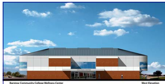
Conceptual drawing of the wellness center addition.

Also in the pipeline is a two-story addition to the college gymnasium. This new 29,000 sq ft addition will house a wellness center on the first floor, along with exercise equipment, weights and two classrooms. The second floor will house an indoor track for walking and running activities. Construction of the wellness center is scheduled for the year 2009.