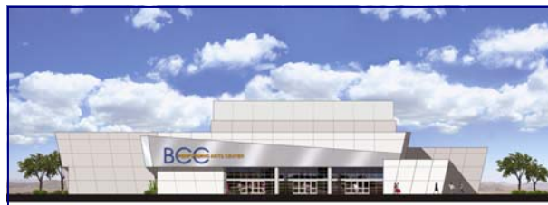
Conceptual drawing of the new performing arts center.

2008 marks the beginning of construction for the college's new performing arts center. This 40,000 sq ft building features a 1,000 seat main theatre and a 200 seat black box theatre. The building also features a chorus studio, dance studio, music room, and a recording studio.